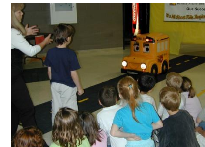
Buster the Bus at the Safety Fun Fair