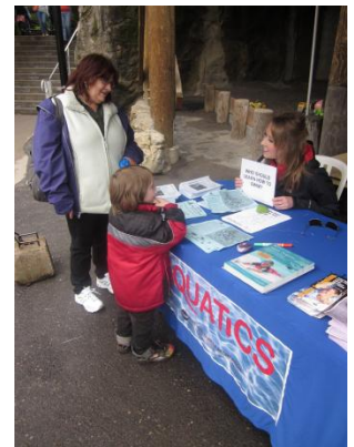
The Water Safety booth at Safe Kids Day at the Zoo

Special thanks go to State Farm, who sponsored promos on Radio Disney, along with the show on event day. KATU Channel 2 also showed up and got some footage on the day of the event. MANY partners commented on what wonderful student volunteers they had- likely due to the Volunteer Coordinator and Volunteer Training!