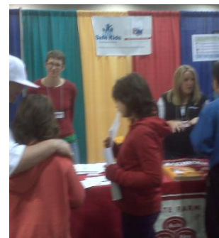
The "CountDown2Drive" booth at Kidfest.

Safe Kids Oregon & Safe Kids Portland Metro staffed a pre-driver Countdown2Drive educational booth during Kidfest 2011. While older kids signed up on the Countdown2Drive website with their parents at the event, younger kids played the "Ride Like a Friend" beanbag game next door. Thanks go to Radio Disney and State Farm for their ongoing support of this important program. More Countdown2Drive events are being scheduled for the summer months.